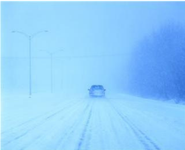
Is this a good or bad winter scene?

The more people exposed to the 'good winter', the more likely perceptions will change.